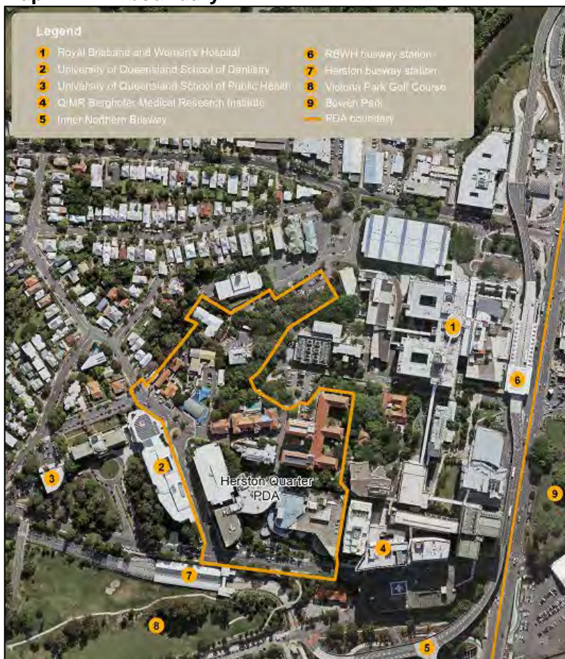
Map 1: PDA boundary