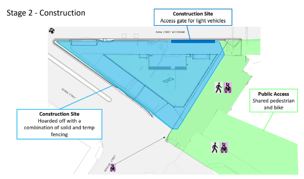
Figure 4.2 Construction Stage 2 - Construction

Works on Makerston Street are likely to include road marking, removal of existing kerbs and reconfigured stopping bays.