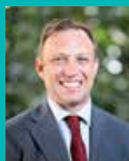
The Honourable Steven Miles MP Deputy Premier and Minister for State Development, Infrastructure, Local Government and Planning

To ensure our infrastructure strategy captures the right building blocks for the future, I'd encourage you to provide feedback on this draft document. Together, we can ensure that Queensland's infrastructure investments maximise opportunities for our future.