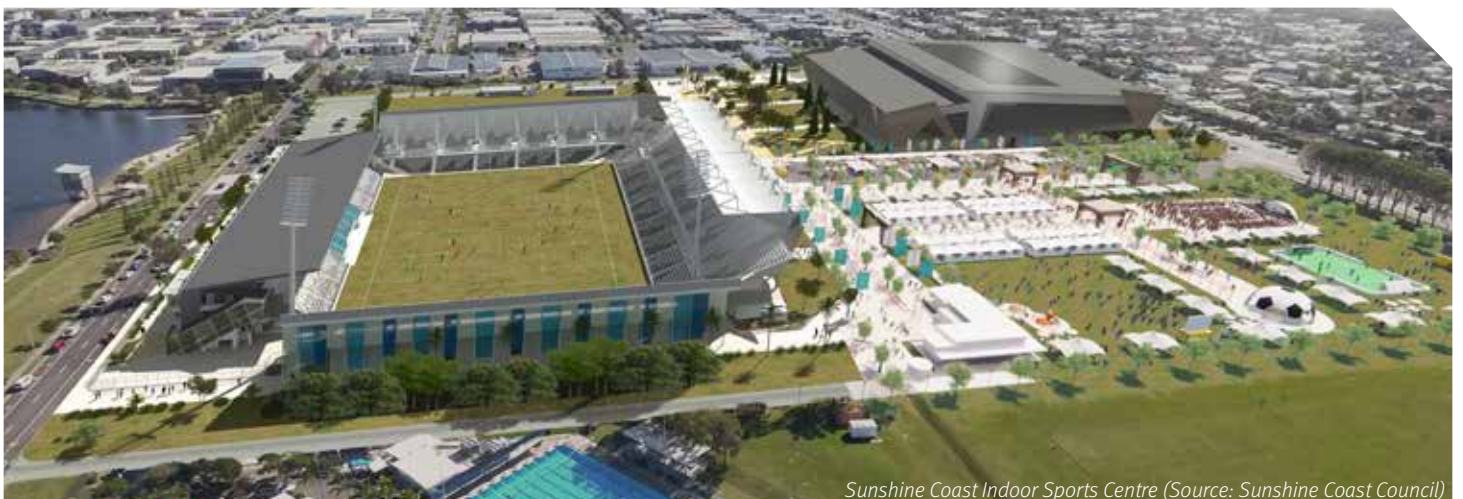
Sunshine Coast Indoor Sports Centre