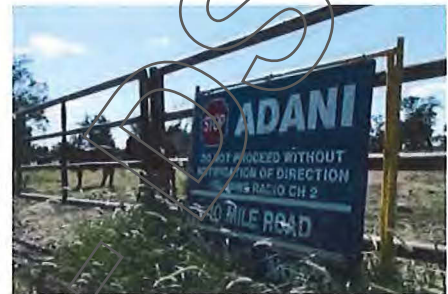
PHOTO: Adani says its mine will create 10,000 local jobs.

RELATED STORY: Queensland Government will facilitate potential Adani loan, Treasurer says