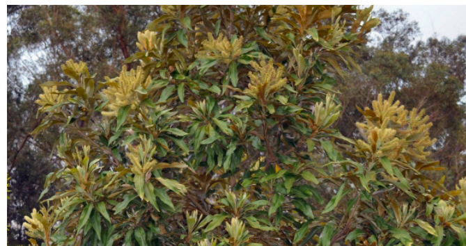
GREVILLEA baileyana - street / carpark tree