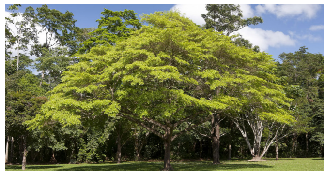
TERMINALIA sericocarpa - planting area trees