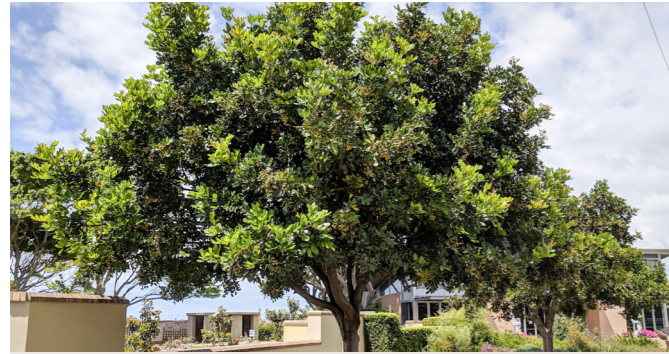
CUPANIOPSIS anacardioides - street / carpark tree